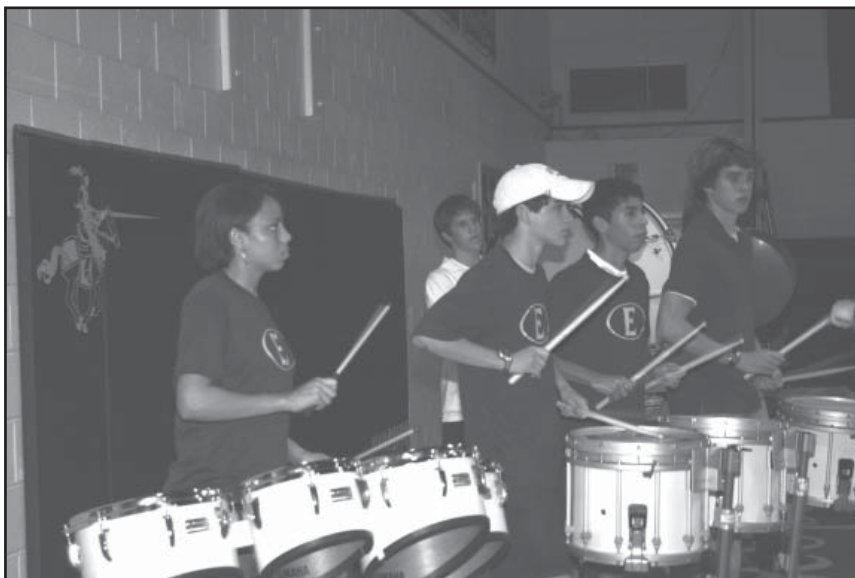
The drum corps added a spark to the the Homecoming pep rally.